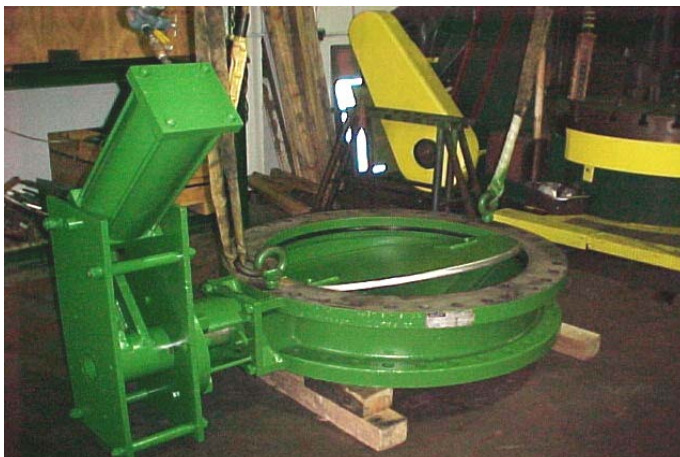
42" Pratt Butterfly Vlv: new seat, repaired and installed actuator.